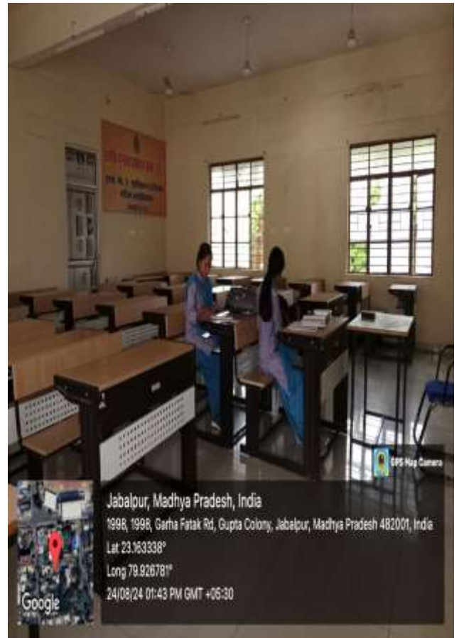
Jabalpur, Madhya Pradesh, India 199R, 199R, Garha Fatak Rd, Gupta Colony, Jabalpur, Madhya Pradesh 482001, India Lat 23.163338° Long 79.926781° 24/08/24 01:43 PM GMT +05:30