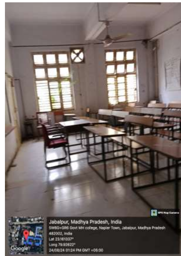
Jabalpur, Madhya Pradesh, India 5W6G+GR6 Govt MH college, Napier Town, Jabalpur, Madhya Pradesh 482002, India Lat 23.161937° Long 79.92622° 24/08/24 01:24 PM GMT +05:30