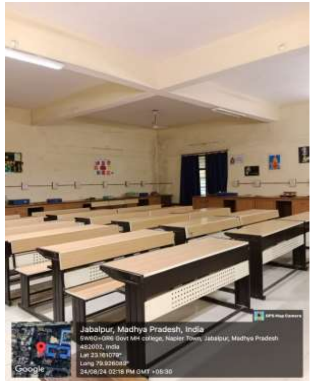
Jabalpur, Madhya Pradesh, India 5W6G+GR6 Govt MH college, Napier Town, Jabalpur, Madhya Pradesh 482002, India Lat 23.161079° Long 79.926589° 24/08/24 02:18 PM GMT +05:30