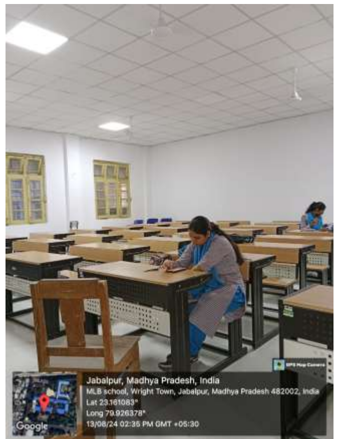
Jabalpur, Madhya Pradesh, India MLB school, Wright Town, Jabalpur, Madhya Pradesh 482002, India Lat 23.161083° Long 79.926378° 13/08/24 02:35 PM GMT +05:30