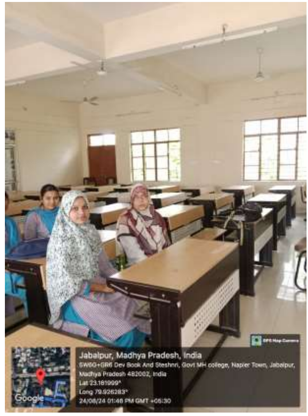
Jabalpur, Madhya Pradesh, India 5W6G+GR6 Dev Book And Steshnn, Govt MH college, Napier Town, Jabalpur, Madhya Pradesh 482002, India Lat 23.161999° Long 79.926283° 24/08/24 01:46 PM GMT +05:30