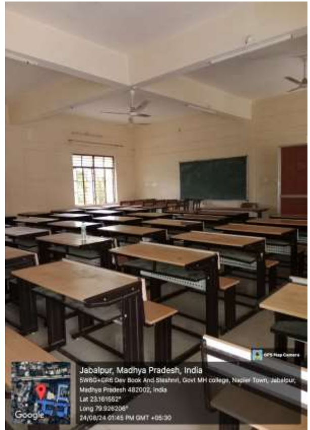
Jabalpur, Madhya Pradesh, India 5W6G+GR6 Dev Book And Stashni, Govt MH college, Napier Town, Jabalpur, Madhya Pradesh 482002, India Lat 23.161562° Long 79.926206° 24/08/24 01:45 PM GMT +05:30