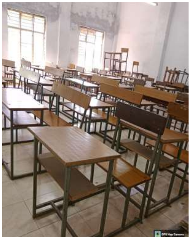
Jabalpur, Madhya Pradesh, India 5W6G+GR6 Dev Book And Steshnri, Govt MH college, Napier Town, Jabalpur, Madhya Pradesh 482002, India Lat 23.161549° Long 79.926075° 13/08/24 02:54 PM GMT +05:30