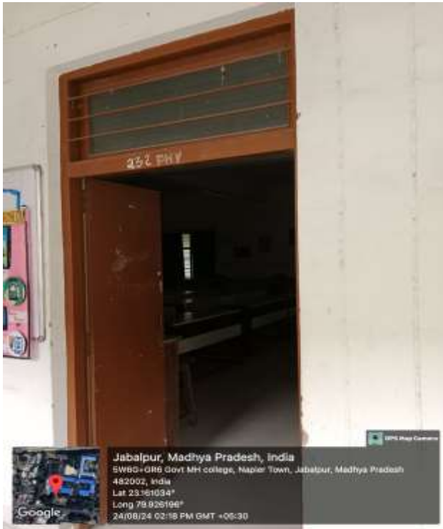
Jabalpur, Madhya Pradesh, India 5W6G+GR6 Govt MH college, Napier Town, Jabalpur, Madhya Pradesh 482002, India Lat 23.161034° Long 79.925196° 24/08/24 02:18 PM GMT +05:30