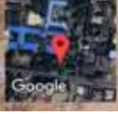
Jabalpur, Madhya Pradesh, India 5W6G+GR6, Napier Town, Jabalpur, Madhya Pradesh 482002, India Lat 23.160916° Long 79.927143° 28/08/24 01:52 PM GMT +05:30