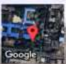
Jabalpur, Madhya Pradesh, India MLB school, Wright Town, Jabalpur, Madhya Pradesh 482002, India Lat 23.160919° Long 79.927188° 28/08/24 01:52 PM GMT +05:30