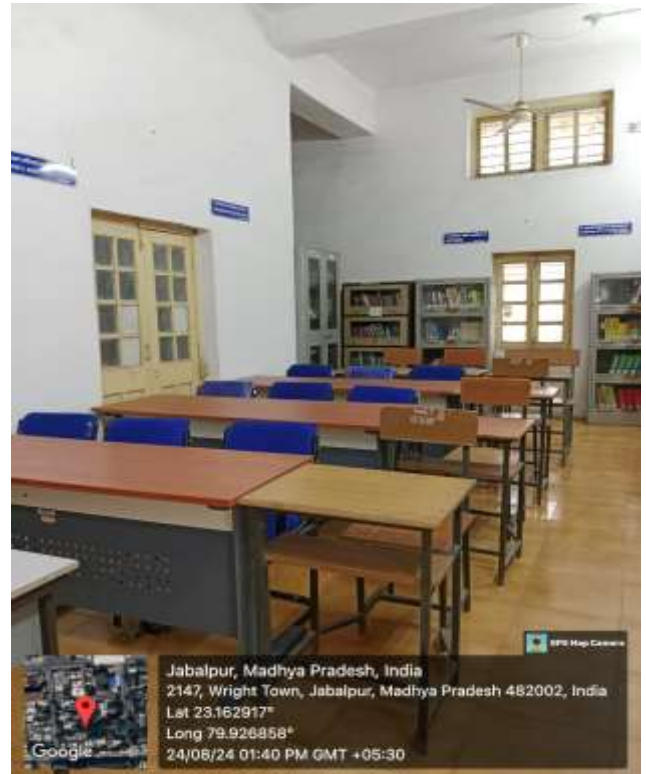
Jabalpur, Madhya Pradesh, India 2147, Wright Town, Jabalpur, Madhya Pradesh 482002, India Lat 23.162917° Long 79.926858° 24/08/24 01:40 PM GMT +05:30