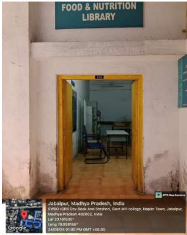
Jabalpur, Madhya Pradesh, India 6W5G+GR6 Dev Book And Stashnri, Govt MH college, Napier Town, Jabalpur, Madhya Pradesh 482002, India Lat 23.161536° Long 79.926185° 24/08/24 01:40 PM GMT +05:30