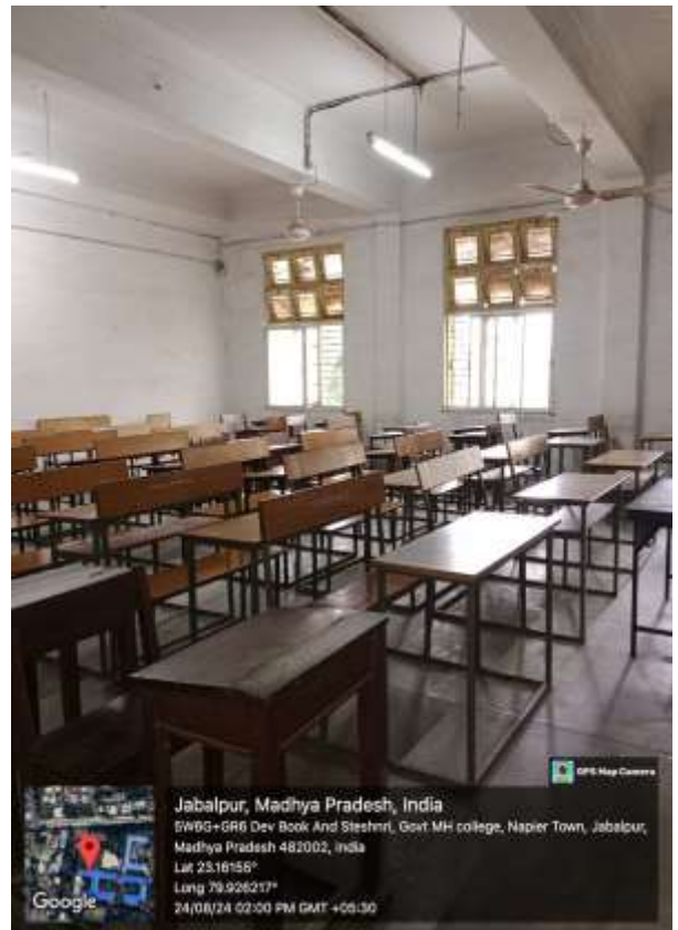
Jabalpur, Madhya Pradesh, India 5W6G+GR6 Dev Book And Stashni, Govt MH college, Napier Town, Jabalpur, Madhya Pradesh 482002, India Lat 23.16155° Long 79.926217° 24/08/24 02:00 PM GMT +05:30