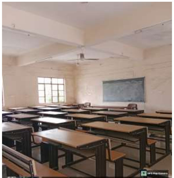
Jabalpur, Madhya Pradesh, India 5W6G+GR6 Dev Book And Steshnri, Govt MH college, Napier Town, Jabalpur, Madhya Pradesh 482002, India Lat 23.161726° Long 79.926299° 28/08/24 03:48 PM GMT +05:30