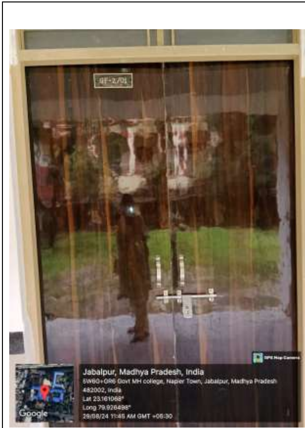
Jabalpur, Madhya Pradesh, India 5W60+GR6 Govt MH college, Napier Town, Jabalpur, Madhya Pradesh 482002, India Lat 23.161068° Long 79.926498° 29/08/24 11:45 AM GMT +05:30