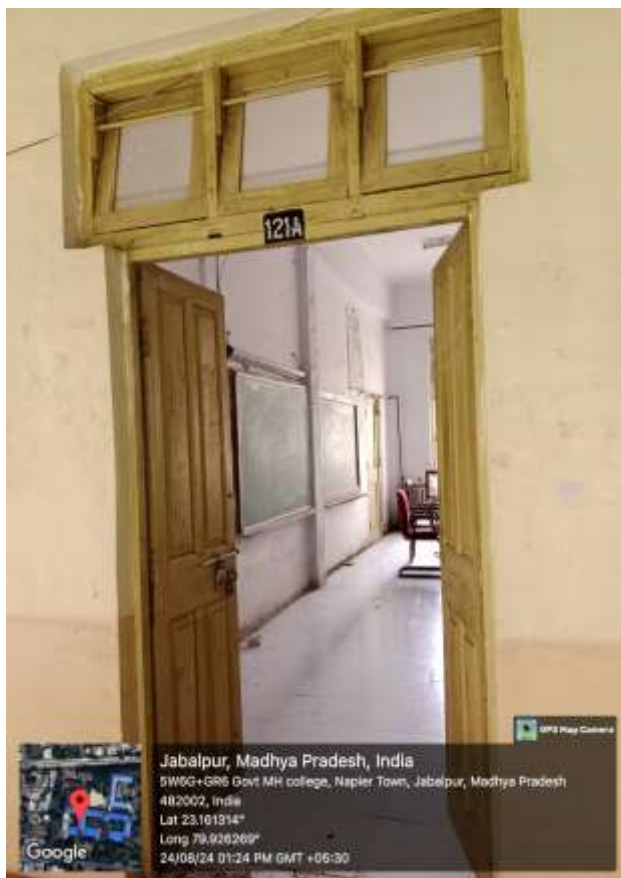
Jabalpur, Madhya Pradesh, India 5W6G+GR6 Govt MH college, Napier Town, Jabalpur, Madhya Pradesh 482002, India Lat 23.161914° Long 79.926269° 24/08/24 01:24 PM GMT +05:30