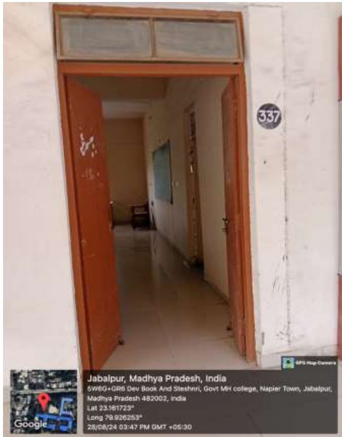
Jabalpur, Madhya Pradesh, India 5WBG+GR6 Dev Book And Steshnri, Govt MH college, Napier Town, Jabalpur, Madhya Pradesh 482002, india Lat 23.181723° Long 79.926253° 28/08/24 03:47 PM GMT +05:30