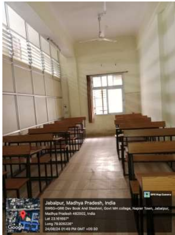
Jabalpur, Madhya Pradesh, India SW60+GR6 Dev Book And Steshnri, Govt MH college, Napier Town, Jabalpur, Madhya Pradesh 482002, India Lat 23.161697° Long 79.926228° 24/08/24 01:49 PM GMT +05:30