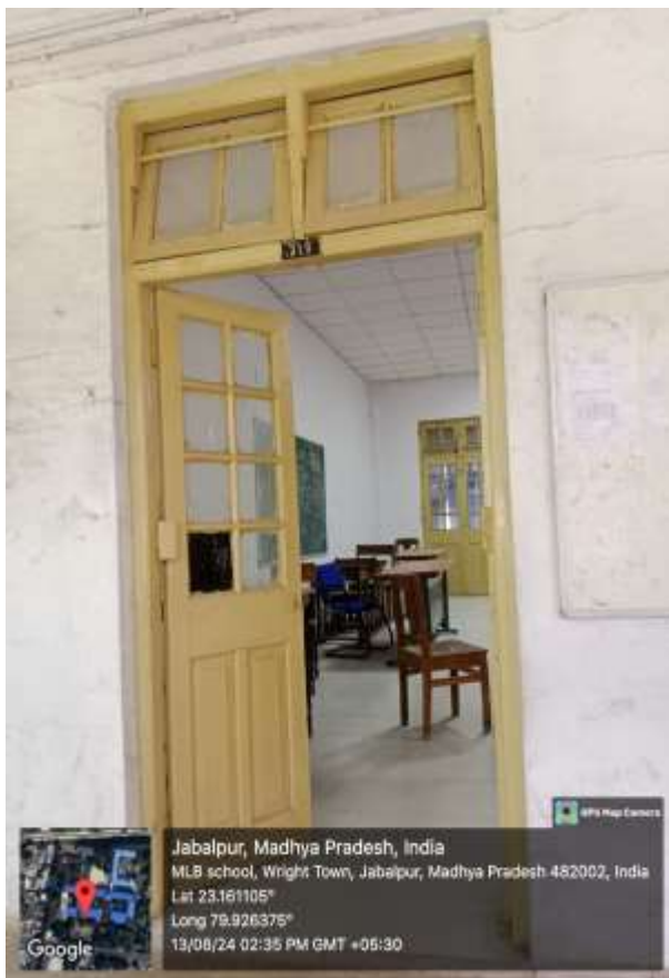
Jabalpur, Madhya Pradesh, India MLB school, Wright Town, Jabalpur, Madhya Pradesh 482002, India Lat 23.161105° Long 79.926375° 13/08/24 02:35 PM GMT +05:30