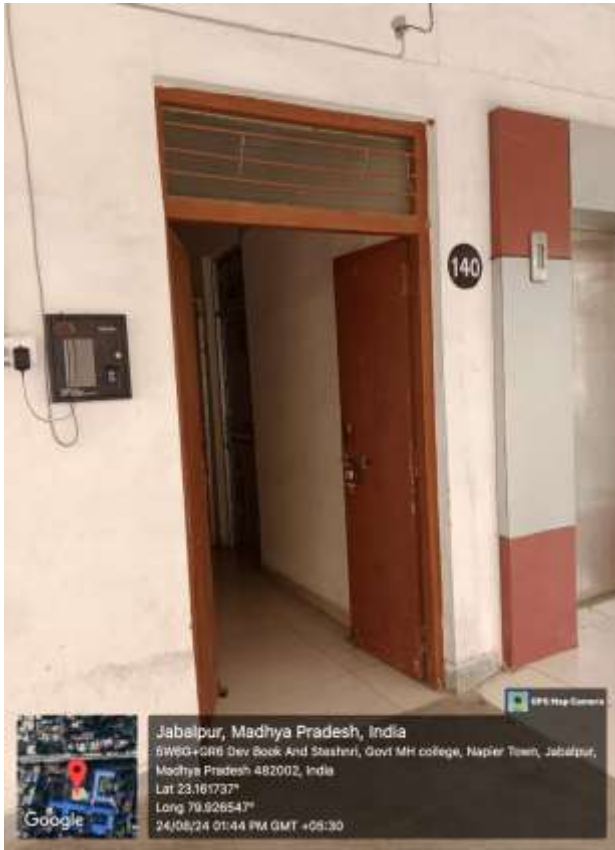
Jabalpur, Madhya Pradesh, India 5W6G+GR6 Dev Book And Stashni, Govt MH college, Napier Town, Jabalpur, Madhya Pradesh 482002, India Lat 23.161737° Long 79.926547° 24/08/24 01:44 PM GMT +05:30