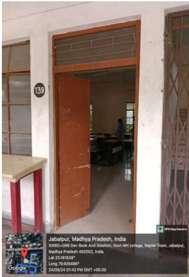
Jabalpur, Madhya Pradesh, India 5W5G+GR6 Dev Book And Stashnri, Govt MH college, Napier Town, Jabalpur, Madhya Pradesh 482002, India Lat 23.161838° Long 79.926486° 24/08/24 01:42 PM GMT +05:30