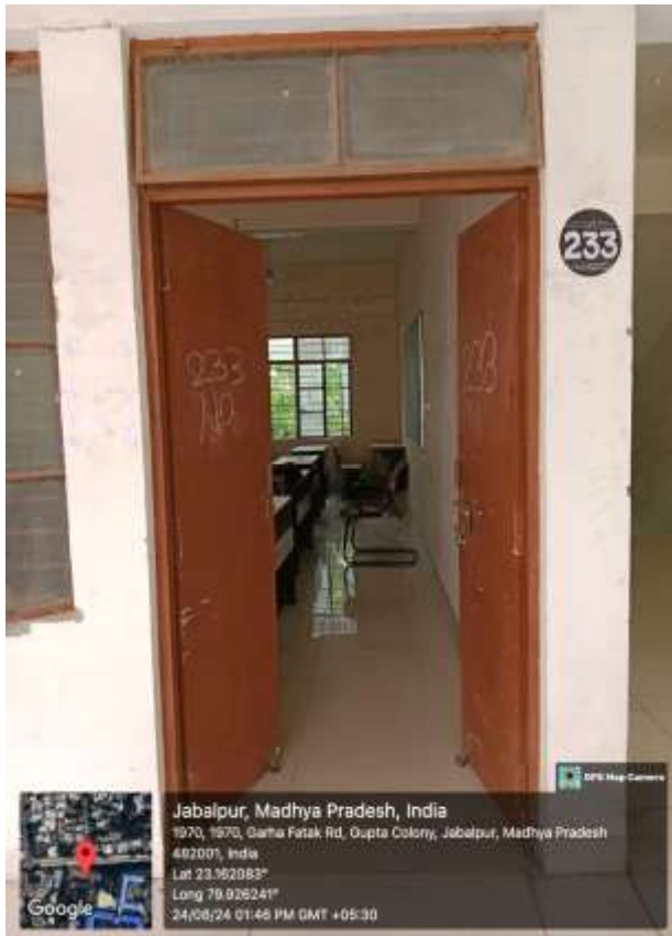
Jabalpur, Madhya Pradesh, India 1970, 1970, Sarha Fatak Rd, Oupita Colony, Jabalpur, Madhya Pradesh 482001, India Lat 23.162083° Long 79.926241° 24/08/24 01:46 PM GMT +05:30