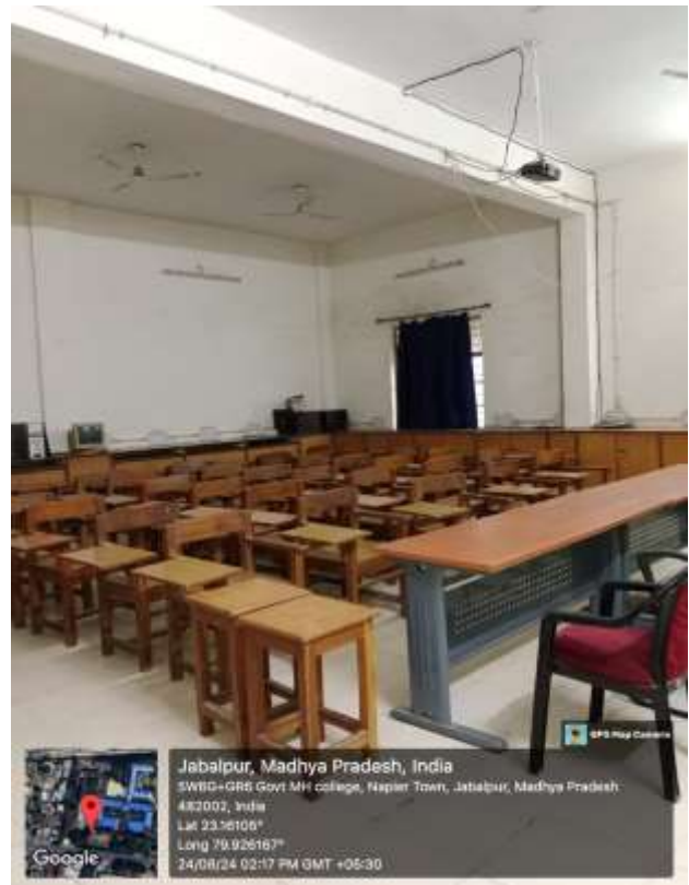
Jabalpur, Madhya Pradesh, India 5WBG+GR6 Govt MH college, Napier Town, Jabalpur, Madhya Pradesh 482002, India Lat 23.16100° Long 79.926167° 24/08/24 02:17 PM GMT +05:30