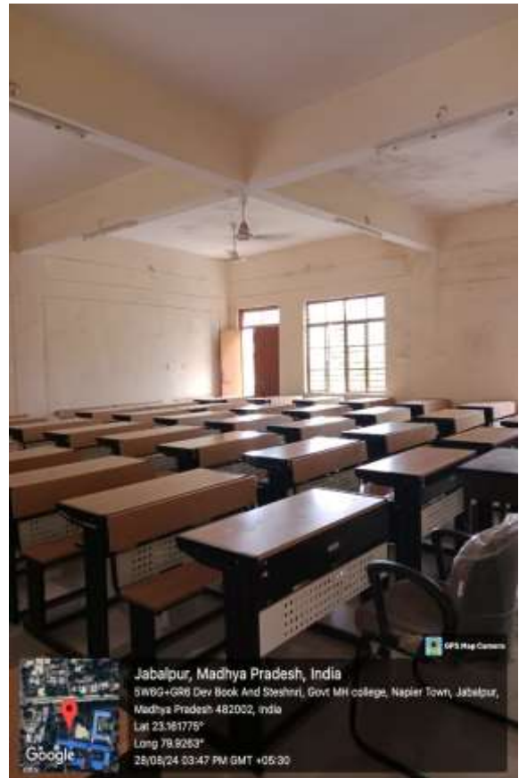
Jabalpur, Madhya Pradesh, India 5WBG+GR6 Dev Book And Steshnri, Govt MH college, Napier Town, Jabalpur, Madhya Pradesh 482002, india Lat 23.181775° Long 79.9263° 28/08/24 03:47 PM GMT +05:30