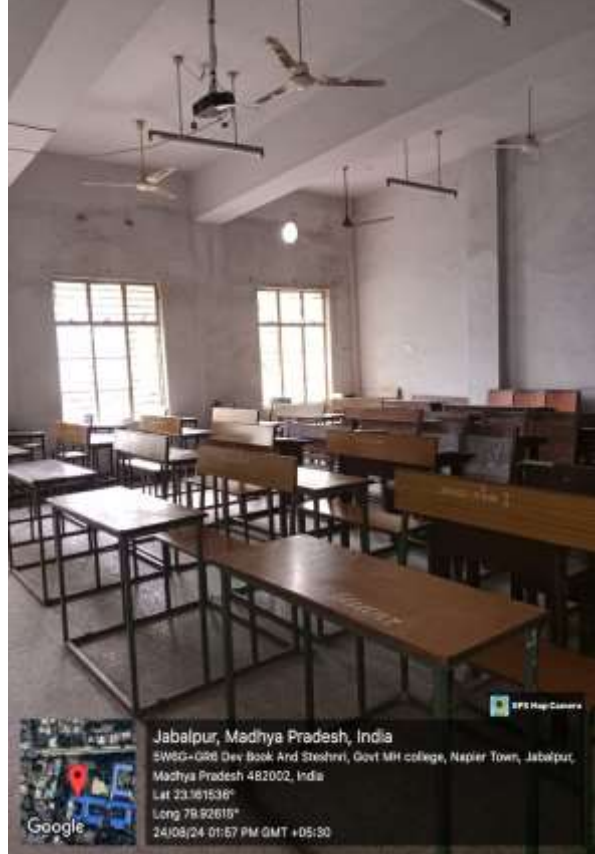
Jabalpur, Madhya Pradesh, India SW60+GR6 Dev Book And Steshnri, Govt MH college, Napier Town, Jabalpur, Madhya Pradesh 482002, India Lat 23.161536° Long 79.92619° 24/08/24 01:57 PM GMT +05:30