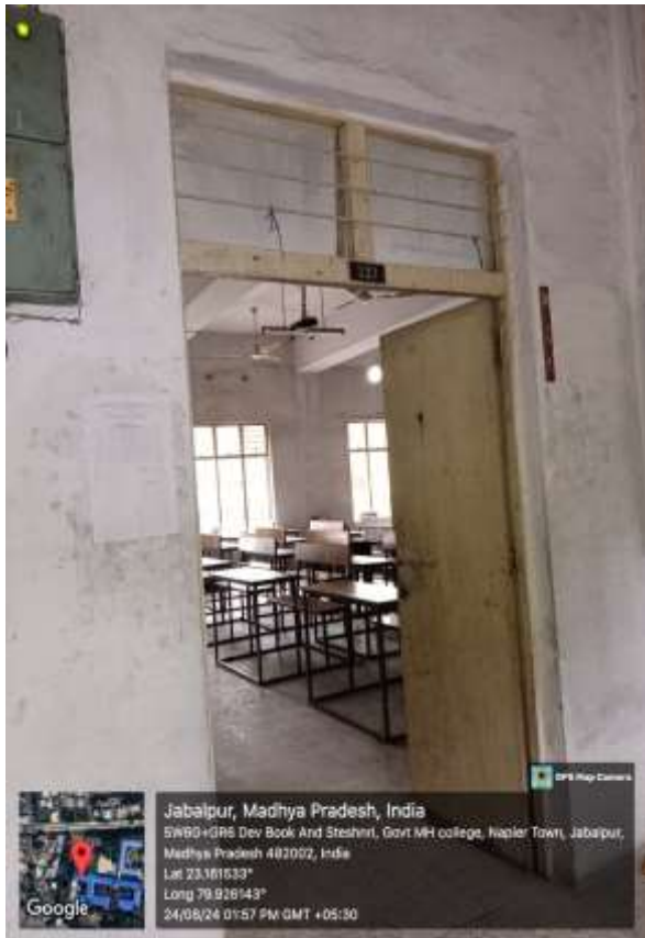
Jabalpur, Madhya Pradesh, India SW60+GR6 Dev Book And Steshnri, Govt MH college, Napier Town, Jabalpur, Madhya Pradesh 482002, India Lat 23.161533° Long 79.926143° 24/08/24 01:57 PM GMT +05:30