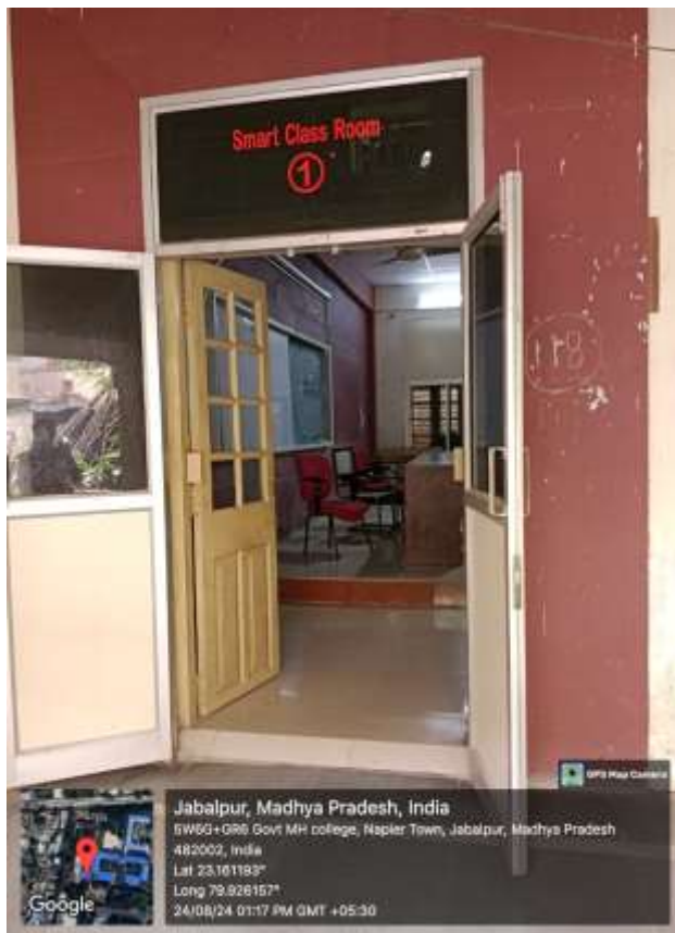
Jabalpur, Madhya Pradesh, India 5W6G+GR6 Govt MH college, Napier Town, Jabalpur, Madhya Pradesh 482002, India Lat 23.161193° Long 79.926157° 24/08/24 01:17 PM GMT +05:30