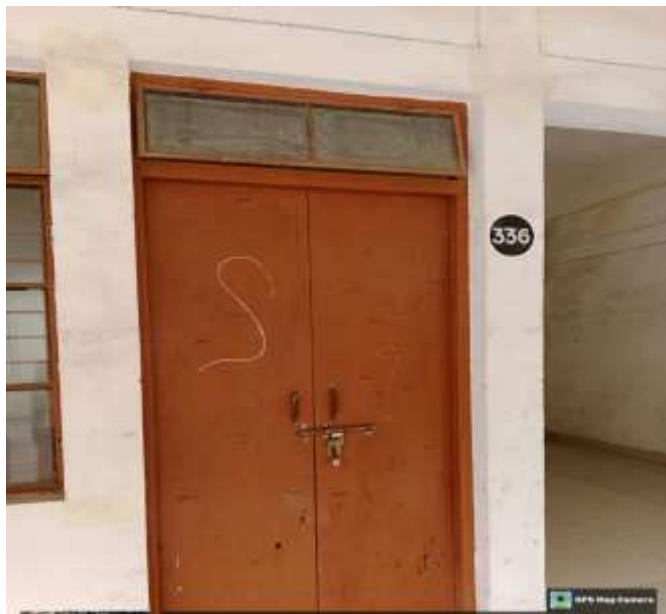
Jabalpur, Madhya Pradesh, India 5W6G+GR6 Dev Book And Steshnri, Govt MH college, Napier Town, Jabalpur, Madhya Pradesh 482002, India Lat 23.161688° Long 79.926238° 28/08/24 03:47 PM GMT +05:30