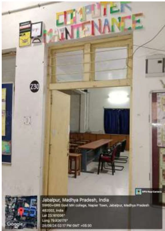
Jabalpur, Madhya Pradesh, India 5WBG+GR6 Govt MH college, Napier Town, Jabalpur, Madhya Pradesh 482002, India Lat 23.161006° Long 79.926176° 24/08/24 02:17 PM GMT +05:30