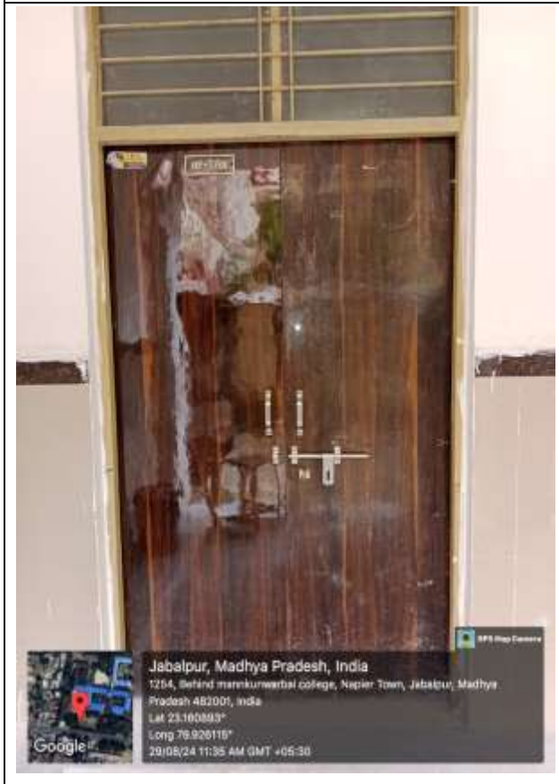
Jabalpur, Madhya Pradesh, India 1254, Behind manekunwarbal college, Napier Town, Jabalpur, Madhya Pradesh 481001, India Lat 23.160893° Long 79.926115° 29/08/24 11:35 AM GMT +05:30