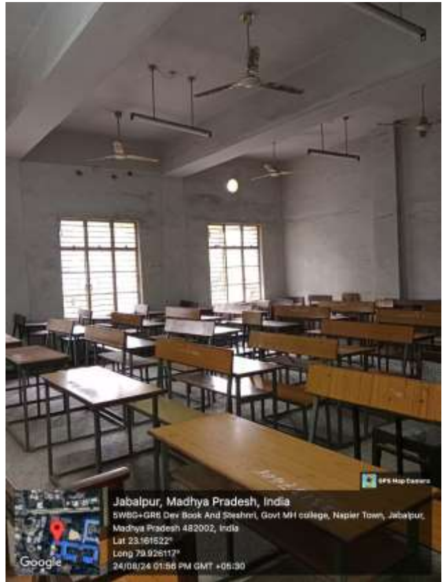
Jabalpur, Madhya Pradesh, India 5WBG+GR6 Dev Book And Seshri, Govt MH college, Napier Town, Jabalpur, Madhya Pradesh 482002, India Lat 23.161522° Long 79.926117° 24/08/24 01:58 PM GMT +05:30