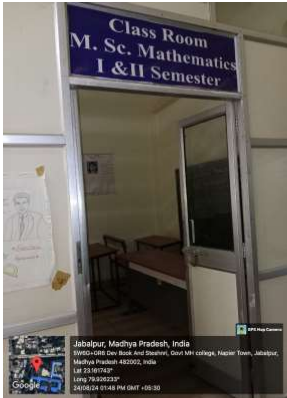
Jabalpur, Madhya Pradesh, India SW60+GR6 Dev Book And Steshnri, Govt MH college, Napier Town, Jabalpur, Madhya Pradesh 482002, India Lat 23.161743° Long 79.926233° 24/08/24 01:48 PM GMT +05:30