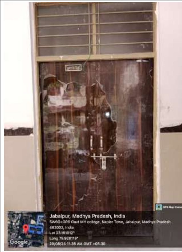
Jabalpur, Madhya Pradesh, India 5W60+GR6 Govt MH college, Napier Town, Jabalpur, Madhya Pradesh 482002, India Lat 23.161012° Long 79.926119° 29/08/24 11:35 AM GMT +05:30