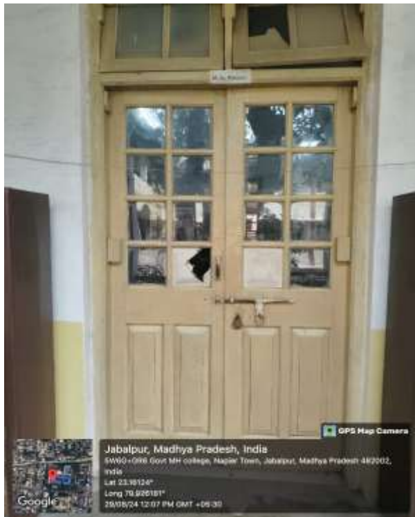
Jabalpur, Madhya Pradesh, India 5WBG+GR6 Govt MH college, Napier Town, Jabalpur, Madhya Pradesh 482002, india Lat 23.18124° Long 79.926181° 28/08/24 12:07 PM GMT +05:30