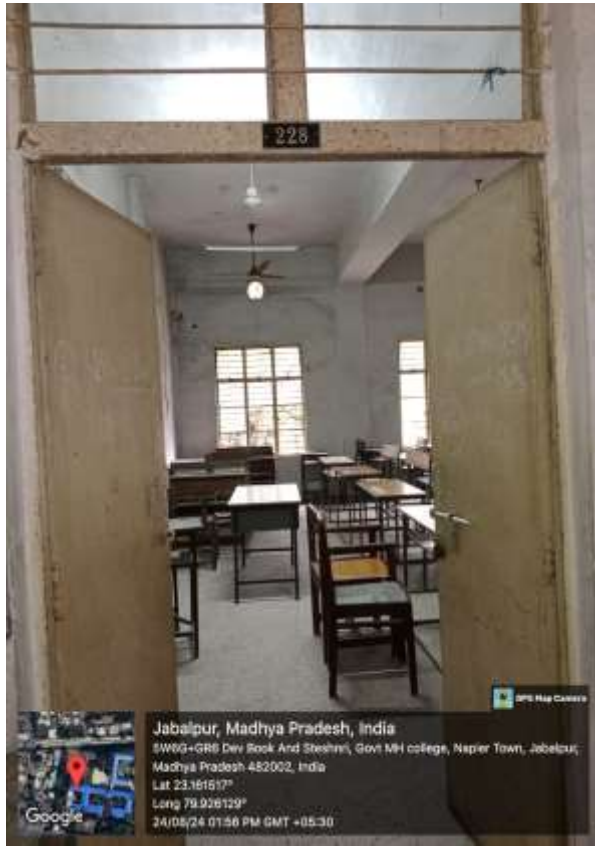
Jabalpur, Madhya Pradesh, India 5WBG+GR6 Dev Book And Seshri, Govt MH college, Napier Town, Jabalpur, Madhya Pradesh 482002, India Lat 23.161617° Long 79.926129° 24/08/24 01:58 PM GMT +05:30