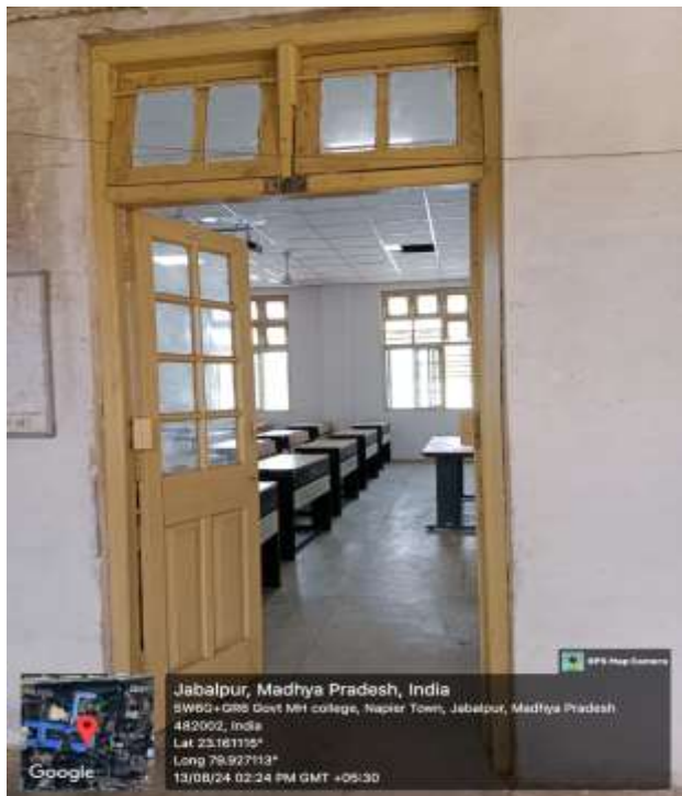
Jabalpur, Madhya Pradesh, India 8W6G+GR6 Govt Mh college, Napier Town, Jabalpur, Madhya Pradesh, 482002, India Lat 23.161195° Long 79.927113° 13/08/24 02:24 PM GMT +05:30