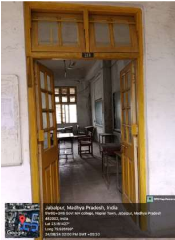
Jabalpur, Madhya Pradesh, India 5W6G+GR6 Govt MH college, Napier Town, Jabalpur, Madhya Pradesh 482002, India Lat 23.161427° Long 79.926109° 24/08/24 02:00 PM GMT +05:30