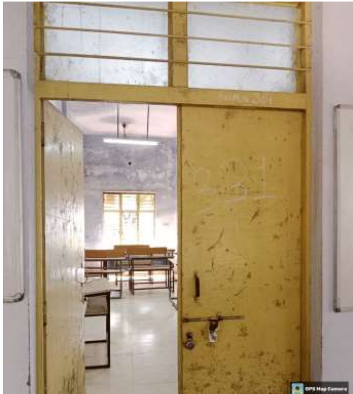
Jabalpur, Madhya Pradesh, India 5W6G+GR6 Dev Book And Steshnri, Govt MH college, Napier Town, Jabalpur, Madhya Pradesh 482002, India Lat 23.161539° Long 79.926096° 13/08/24 02:53 PM GMT +05:30