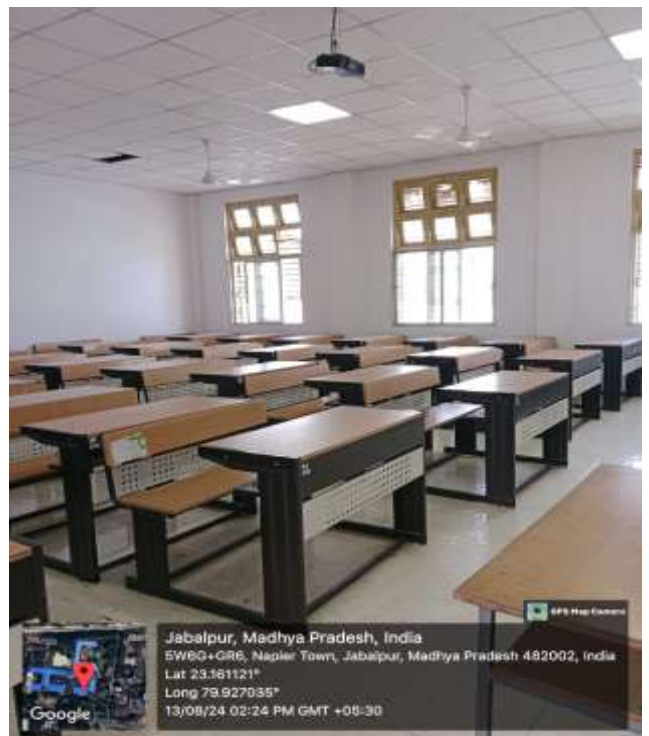
Jabalpur, Madhya Pradesh, India 8W6G+GR6, Napier Town, Jabalpur, Madhya Pradesh 482002, India Lat 23.161121° Long 79.927035° 13/08/24 02:24 PM GMT +05:30