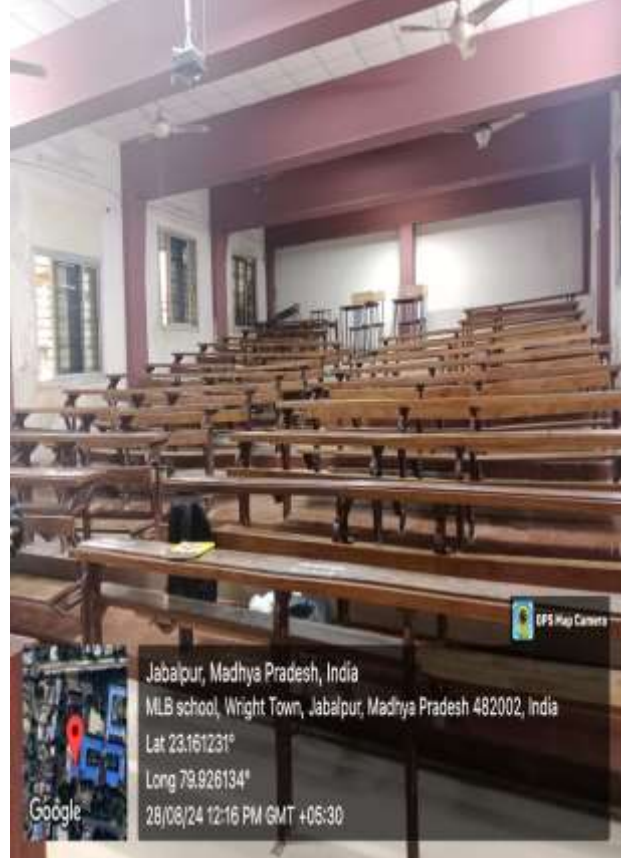
Jabalpur, Madhya Pradesh, India MLB school, Wright Town, Jabalpur, Madhya Pradesh 482002, India Lat 23.161231° Long 79.926134° 28/08/24 12:16 PM GMT +05:30