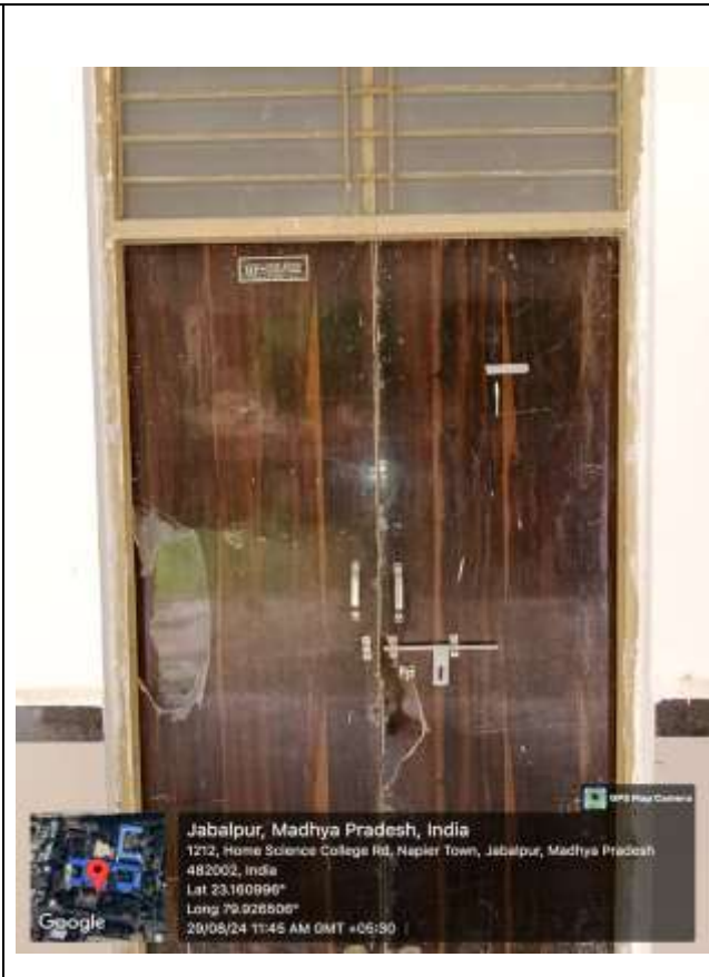
Jabalpur, Madhya Pradesh, India 1212, Home Science College Rd, Napier Town, Jabalpur, Madhya Pradesh 482002, India Lat 23.160996° Long 79.926506° 29/08/24 11:45 AM GMT +05:30